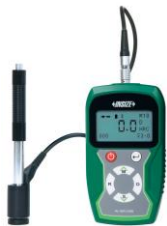
Leeb Hardness Testers