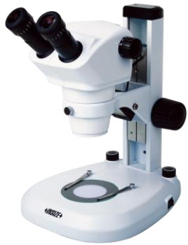
Zoom Stereo Microscopes