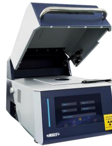
XRF Plating Thickness Instruments