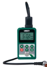
Ultrasonic Thickness Gauges