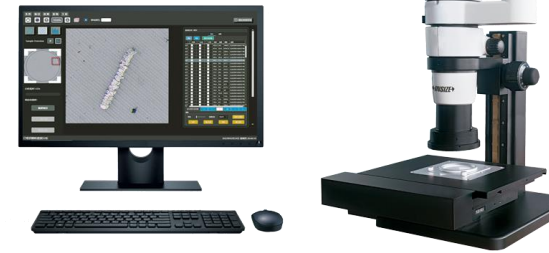
Automatic Cleanliness Analysis Systems