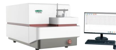
Spark Direct Reading Spectrometers