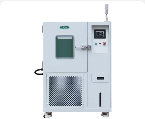
Temperature And Humidity Chambers