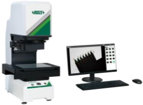
Quick Measurement Systems