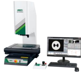
CNC Vision Measuring Systems