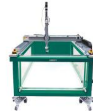
Ultrasonic Water Immersion Detection Systems