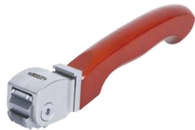
Cross Cut Adhesion Testers