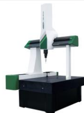
Coordinate Measuring Machines