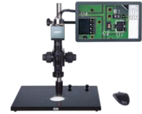
Digital Measuring Microscopes