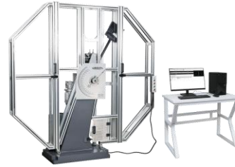
Impact Testing Machines