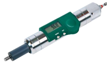
Digital Thread Depth Gauges