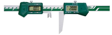
Keyway Symmetry Digital Calipers