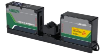
Laser Scan Micrometers