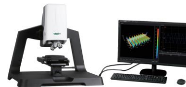
White Light Interference Measuring Microscopes