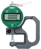
Digital Thickness Gauges