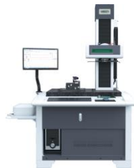
Roughness Measuring Machines