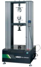
Electronic Universal Testing Machines