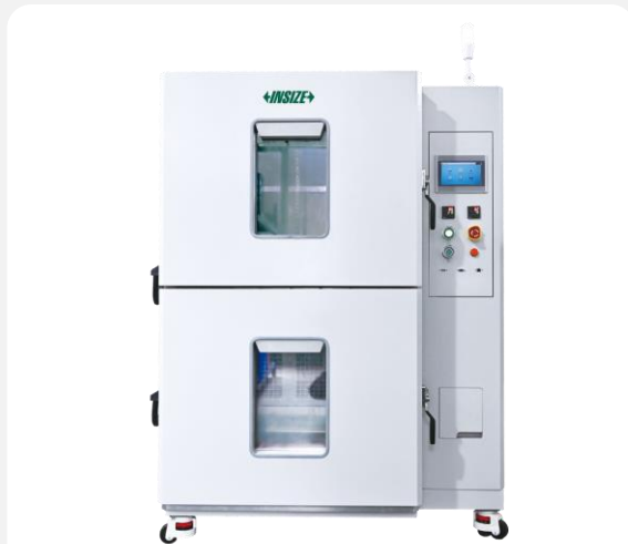
Thermal Shock Test Chambers