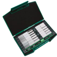
Surface Roughness Specimen Sets