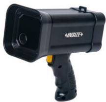
UV/White Light Flaw Detection Lights