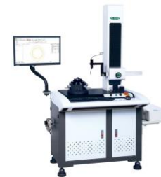
Roundness Measuring Machines