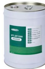
Fluorescent Penetrant Fluids