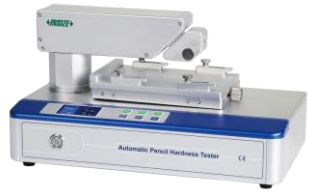
Automatic Pencil Hardness Testers