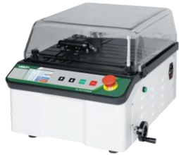
Automatic Precision Cutting Machines