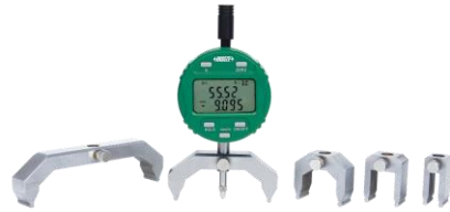
Digital Radius Gauges