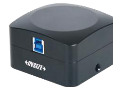
Metallurgical Analysis Software And Cameras