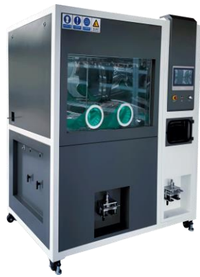
Parts Cleanliness Testing Cabinets