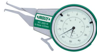
Internal Caliper Gauges