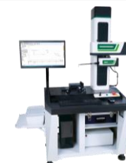
Surface Profile Measuring Machines