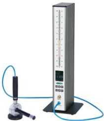
Air Gauges And Displays