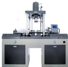
Vertical Bending Testing Machines