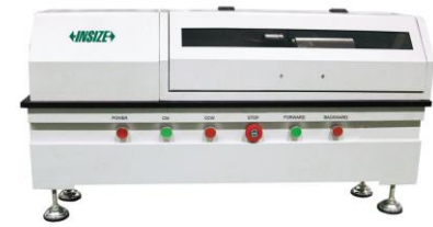
Electronic Torsion Testing Machines