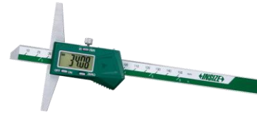
Digital Depth Gauges