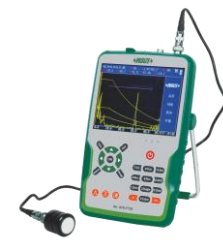
Ultrasonic Flaw Detectors