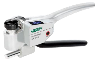
Aluminum Hardness Testers