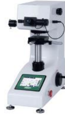
Vickers Hardness Testers