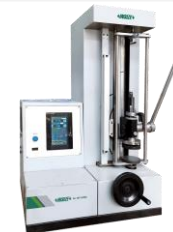
Manual Spring Testing Machines