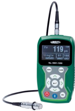
Coating Thickness Gauges