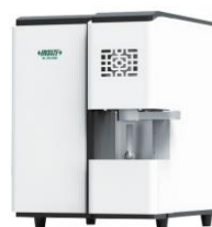
Carbon And Sulfur Analyzers