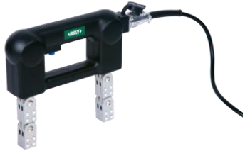
Magnetic Powder Flaw Detectors