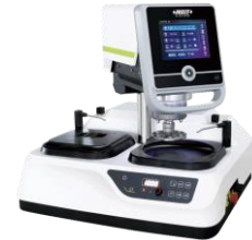
Automatic Grinder And Polishers