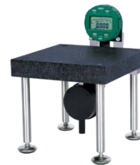
Flatness Measurement Stands