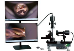
Dual-Display Cutting Tools Microscopes