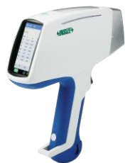
Handheld XRF Alloy Analyzers