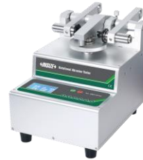
Rotational Abrasion Testers