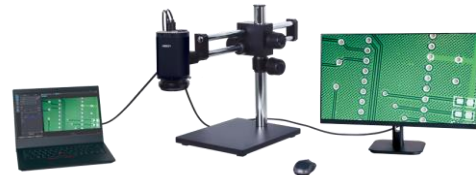
Auto Focus Digital Microscopes