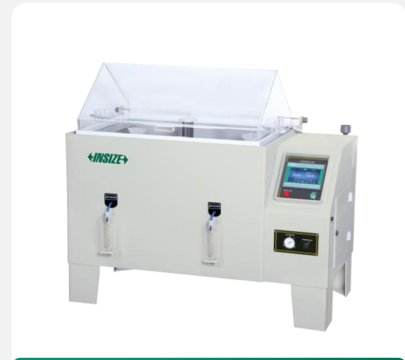
Salt Spray Test Chambers