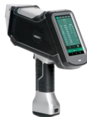
Handheld Libs Spectrometers