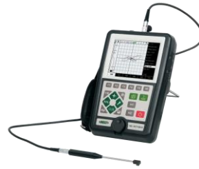
Eddy Current Flaw Detectors